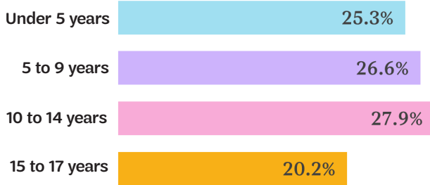
Percent of girls under 18, by age group

7,485 girls are under 18 years old in Erie County